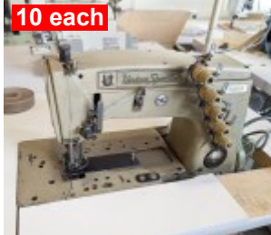
10 each U.S. Model 57800 3 Needle Coverstitch Complete with TSM $895.00 each