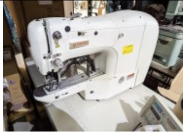
Singer Model 2675E-42G Programmable Bar Tacker $1,475.00