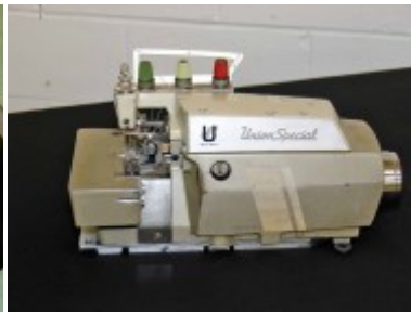
Union Special Model 39500 3 or 4 Thread Serger...Over 100 each...Sold Head Only $125.00 each