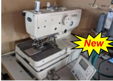
Typical Model GT-9820 Keyhole Button Hole Programmable $5,995.00