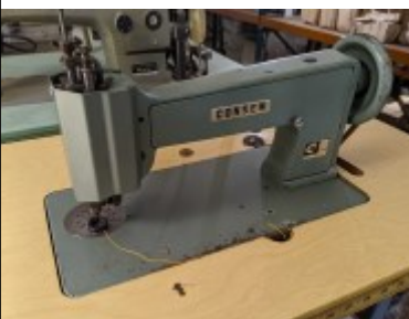
Consew Model 104 Single Needle Embroidery Manual Operation $895.00