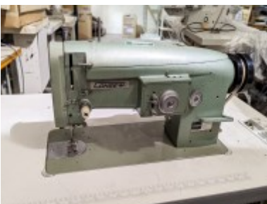
Consew Model 199R-2A Single Needle Zigzag Large Width, Manual $1,250.00