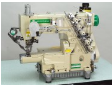
Megasew MJ2600SD-364 3 NDL, Cover Stitch, Full Auto SMALL Cylinder $1,995.00