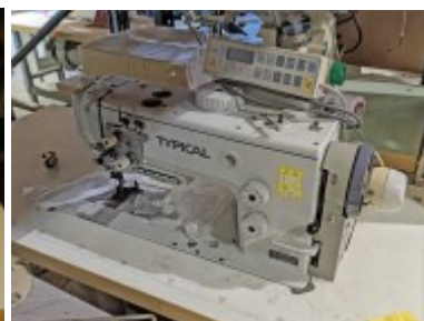
Typical Model TW2-899S 2 NDL, Walking Foot Full Auto, Electric/Air $1,995.00