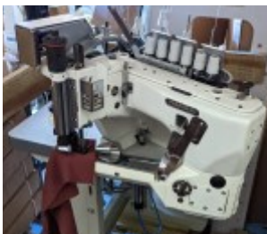
K.S. Model SX-6803P 3 Needle Chainstitch Off Arm for Jeans $2,450.00