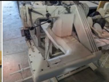
Brother Model DT6-B927 3 NDL, Chain Stitch Off the arm w/Puller $1,795.00