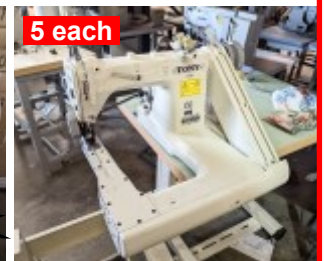
5 each Tony Model H-927-M 2 Needle Chainstitch off arm w/ Puller, 3/16" ga $2,250.00 each