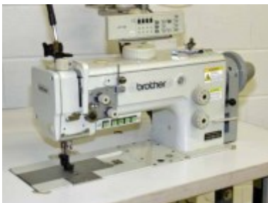
Brother Model LT2-B892 2 Needle Walking Foot Full Automatic, Electric/Air $1,995.00