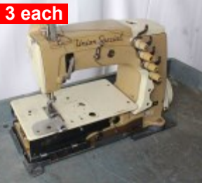
3 each U.S. Model 56400 2 Needle, 1/4" Gauge Chainstitch, Head Only $695.00 each