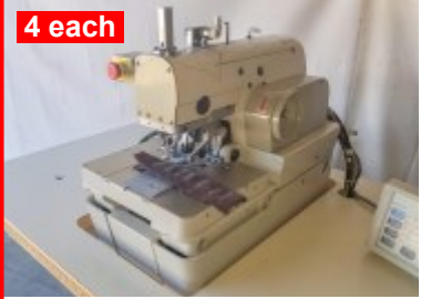
Brother Model DH4-B980 Keyhole Button Hole Programmable Like New $4,995.00 each