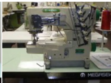
Megasew MJ2600SD-356 3 NDL, Cover Stitch, Cylinder Full Automatic $1,795.00