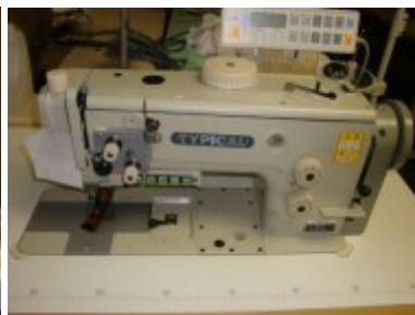
Typical Model TW1-899S Single Needle Walking Foot Full Auto, Electric/Air $1,995.00