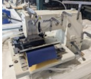
K.S. Model BX-1433P 33 Needle 3/16" gauge Chainstitch w/ Puller $2,795.00