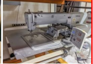
Typical Model TC-3020G Programmable Pattern Sewer 300mm x 200mm sewing area $3,500.00