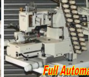
K.S. Model FX-4412P 12 Needle Cylinder Chainstitch w/ Puller $3,250.00