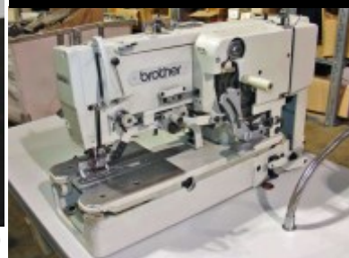
Brother LBH-B816 Lock Stitch Button Hole $1,525.00