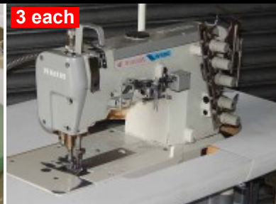
Pegasus model W562 3 NDL, Cover Stitch Flatbed Set up with Full Automatic $1,495.00 each