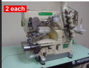
Megasew MJ2600SD-356 3 NDL, Cover Stitch, Full Auto Left Side Trim, Waste Removal $1,995.00 each