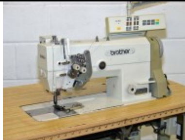
Brother model LT2-B845 2 NDL, Lock Stitch, Split NDL 1/4" NDL Gauge, Full Auto $1,800.00