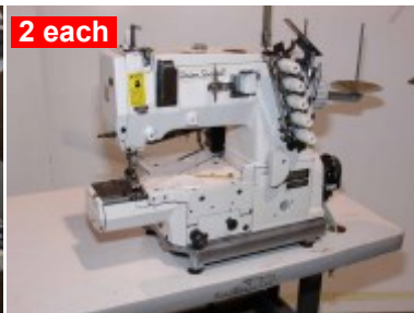
Union Special 3 Needle Cylinder Coverstitch Full Automatic $1,495.00 each