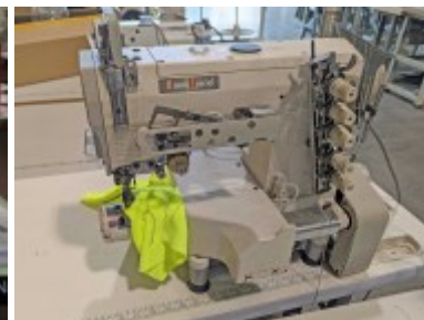
Kansai Special MX-1103 3 NDL, Cover Stitch Small Cylinder, Full Auto $2,250.00