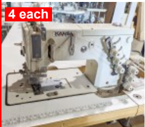
4 each K.S. Model 1503PHD 3 Needle Flat Bed Chainstitch w/ Puller $1,250.00 each