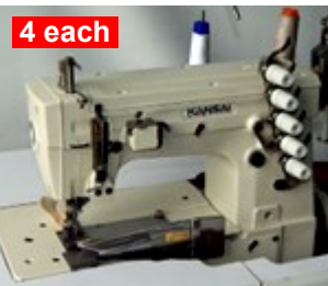
4 each K.S. Model W-8100 3 Needle Flat Bed w/ Binder $795.00 each