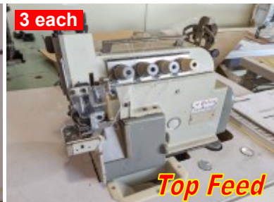
Pegasus Model EXT-5104 3 Thread Cylinder Serger Front Top Feed $1,695.00 each