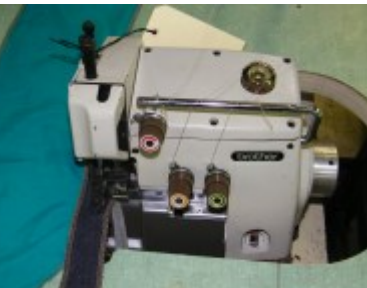
Brother Model EF4-B511 3 Thread Serger Complete TSM $450.00