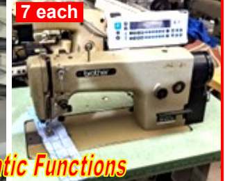
7 each Brother Model B791 Full Auto Needle Feed Updated Servo Motors $795.00 each