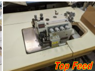
Pegasus Model EXT-3216 5 Thread Safety Serger Front Top Feed $2,250.00