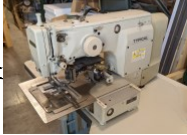
Typical Model TC-130 Programmable Pattern Sewer 130mm x 60mm sewing area $4,500.00