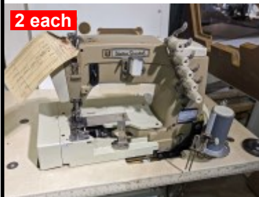
Union Special Model FS122C209MXA03 Coverstitch Binder/Elastic Feed $1,250.00 each