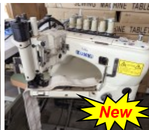
Tony Model H-35800 3 Needle Chainstitch Off Arm for Jeans $3,750.00