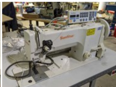
Sunstar Model KM-570B-7 Single Needle Walking Foot Full Automatic $995.00