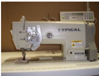
Typical GC-6845MD3 2 Needle Lock Stitch, 1/4" ga Split Needle Bar, Full Auto $1,475.00