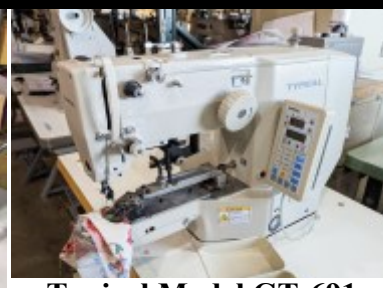
Typical Model GT-691 Lockstitch Button Sew Programmable $2,995.00