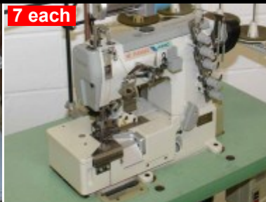
Pegasus Model W562 3 NDL, Cover Stitch Right Side Trim, Manaul $995.00 each