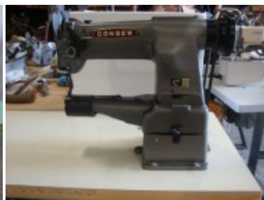
Consew Model 207 Single Needle, Cylinder Darning & Mending Machine $695.00