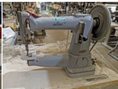
Adler Model 105-25MO Single Needle Shuttle Hook Extra Heavy Duty Cylinder $2,850.00