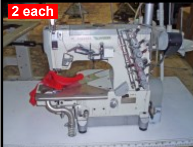
Pegasus W664-35AC 3 NDL, Cover Stitch Cylinder, Left Trim, Auto $2,450.00 each