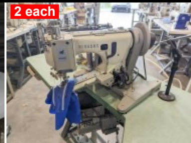
Pegasus model FW603 3 NDL, Cover Stitch Up the Arm, Full Auto $1,995.00 each